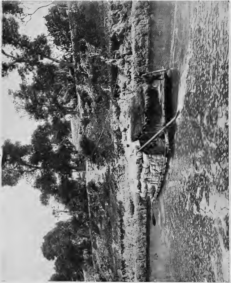
Cotton Boat on Tapaing River above Bhamo